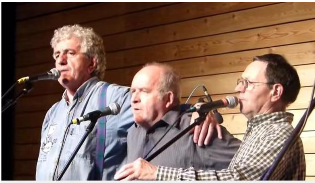
Rond balancé de Dol ( par les Chantous d'Loudia ) fest noz Arradon 10/05/2014

DDG2|B2GG|DDG2|B2GG|DDG2|B2G2|DDG2|B2GG|DDG2|B2GG| DDG2|B2G2|AAA2|B2cB|AGF2|E2D2|DGGG/G/| GBB2|AAAc/A/|G2G2| z4|z4|z4|z4|z4|z4|z4|z4|z4|z4|z4|z4|z4|z4|z4|z4|z4|z4|z4|z4|\ z4|z4|z4|z4|z4|z4|z4|z4|z4