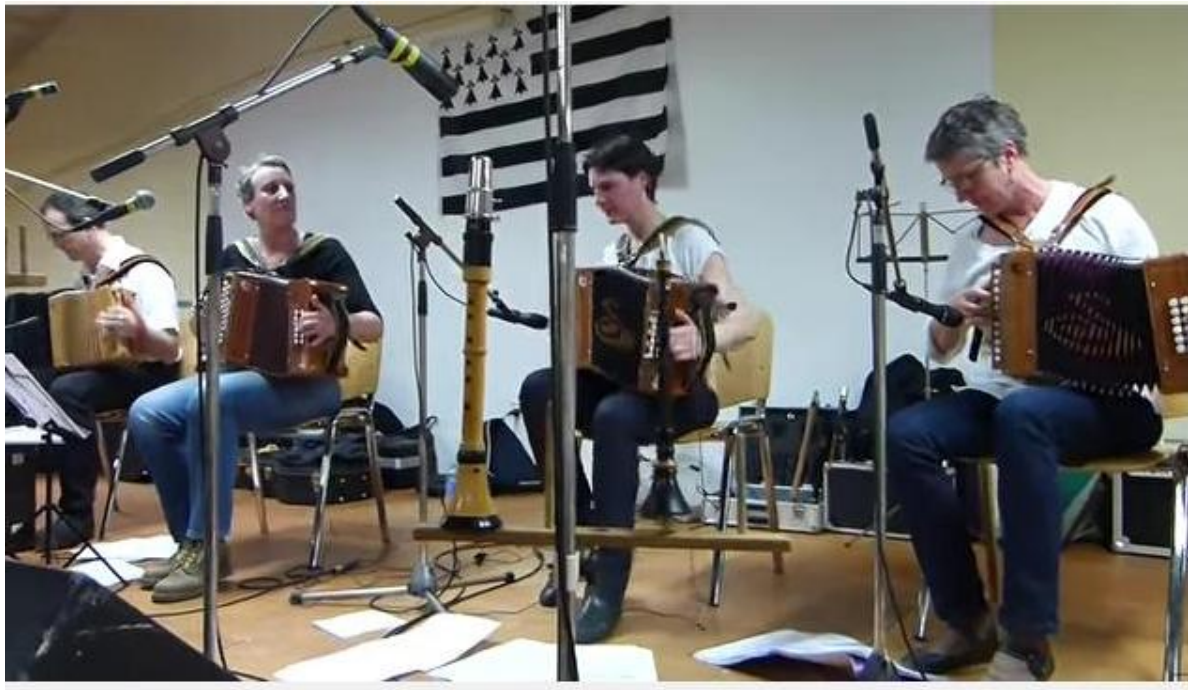
La Sabotée ( par les Diatos Volants ) fest noz Corps-Nuds 24/01/2015

Gceg2g|e2cf3|e3d2c|B2cd3|Gceg2g|e2cf3|e3d2c|B2dc3|c2cc2c|c2cG2G| c2cc2c|c2cG3|c2cc2c|\c2cG2G|c2cc2c|c2cG3|z6|z6|z6|z6|z6|z6|z6|z6|\